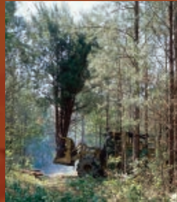
Modern timber cutting uses the latest technology in equipment.

Your goal is to get the maximum value from your harvest — both financially and aesthetically. We understand this value proposition and how to reach it. Whether you are a new client or a long-term contract, our goal is to stay on the job until you are satisfied.