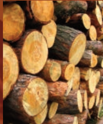
Logs are selected by quality and species at truck loading areas.