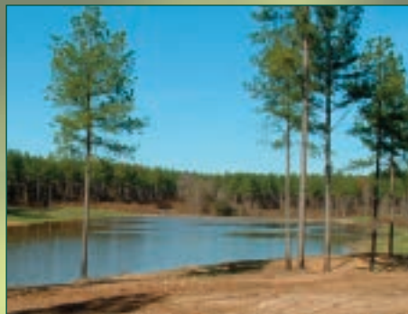
A company-owned property where Scofield's methods have been utilized.

Modern timber harvesting, although economically efficient, can be detrimental to the land, leaving it with diminished value. Scofield's methods are different. We manage our logging crews to perform quality work and to bring good results to landowners. We also explain the entire process in a way that the landowner understands, making him aware of the value and long-range benefit that selective thinning and conscious harvesting can yield.