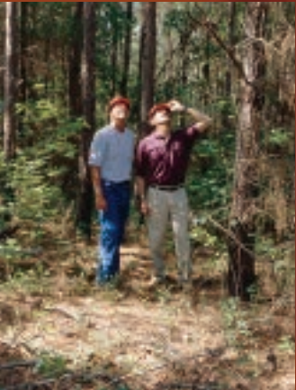
Each tree is hand selected depending on suitability for harvest.

Looking for steady revenue? Thinning trees to enhance land value? Clearing land for development?